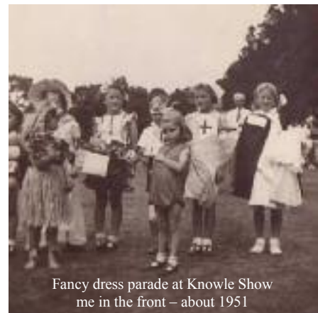
Fancy dress parade at Knowle Show me in the front – about 1951

There was the horticultural show each year, where staff, children, and patients joined together in a day of fun and plenty of competition. The flower arrangements, the preserves, the vegetables, the children's talent competition, the children's fancy dress parade, all ably judged, and it certainly was an honour to win one of these categories. In our house on that day the kitchen was full of flowers waiting for my mother to arrange and hopefully win an award. Then there was the Annual pantomime, put on by members of staff for both children and patients alike to enjoy. The New Years Eve Ball surely the event of the year, where people dressed up in their finery, the hard work of the staff recognized, and plenty of good food and dancing.