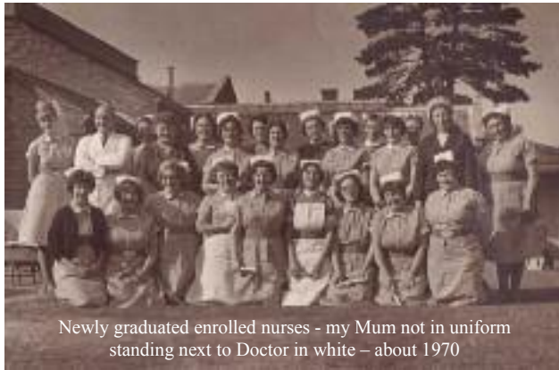
Newly graduated enrolled nurses - my Mum not in uniform standing next to Doctor in white – about 1970

When we started school we were sometimes taunted, "you live in the Loony Bin" and were consequently dubbed "The Knowleites", this sometimes led to the odd skirmish in the school playground, quickly broken up by the teachers. I still feel though, that to this day the children of the estate grew up with strong moral values and a better understanding of people less fortunate than others.