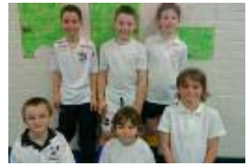
Our six-a-side football team